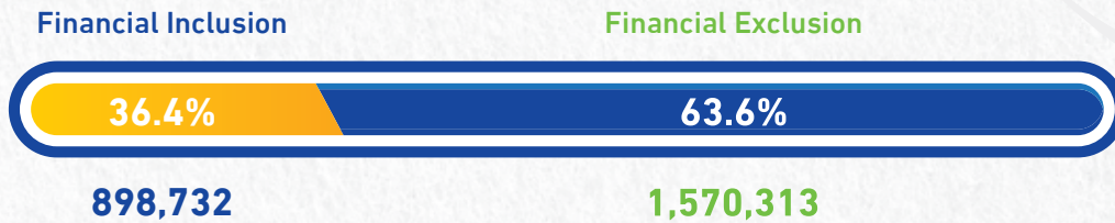
Figure 1: Financial inclusion Strands among adults.

Owning a bank account is considered the first step towards financial inclusion, as banking services is one of the main pathways to the formal financial sector. This is particularly true for Palestine given that there is no mobile financial services operated by a mobile network operator or banks. Generally, opening a current or savings account is often the starting point for participating in the formal financial system.